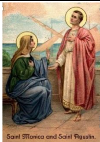
Saint Monica and Saint Augustin.

Wednesday 29 August: The Passion of St. John the Baptist, Martyr.