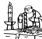
We remember those who have gone before us

In compliance with privacy legislation, names cannot be published in our Parish Bulletin without the permission of the persons themselves or their next of kin.