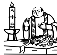
We remember those who have gone before us

In compliance with privacy legislation, names cannot be published in our Parish Bulletin without the permission of the persons themselves or their next of kin.