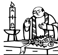
We remember those who have gone before us

In compliance with privacy legislation, names cannot be published in our Parish Bulletin without the permission of the persons themselves or their next of kin.